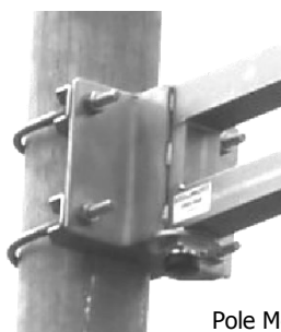
Pole Mount Ø 40÷114 mm